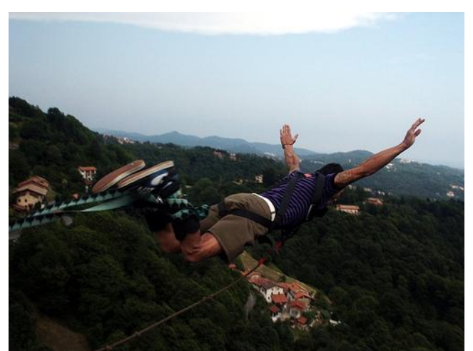
Bungee photo courtesy of Strocchi.

A life list is not something that you create in one sitting and then stick in a drawer and forget about it. You should look at your life list each and every day and make it an integral part of creating your to-do list for each day.